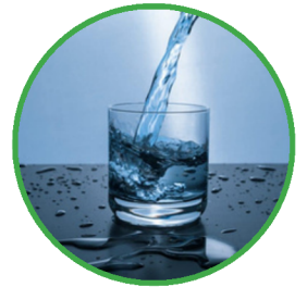
Filtered & chilled drinking water