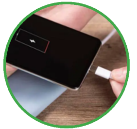
120v power outlets & charging ports